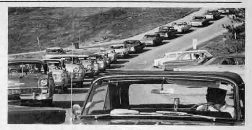
Friday, 4:30 p.m. and where it ends, no one knows . . .

Construction equipment clearing land south of Highway 70 off Florissant Road for a new University entrance. A two-lane road will go past the ML building to the front of the campus and Benton Hall. Completion is set for late this fall or early winter.